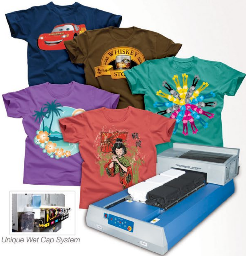
Unique Wet Cap System

This translates into a high profit margin and demand from corporate customers, non profit organizations, school athletics and more.